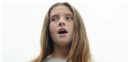
Frame grab: 0:24

The two frame grabs below show the main character, Hannah, at the beginning and the end of the film. Write a short paragraph of 100 words, describing what might happen in between these two images. You must write in the present perfect tense.