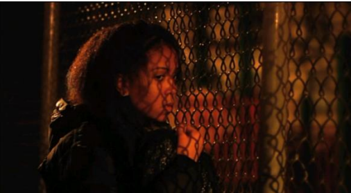
("Premature", framegrabs, timecode 1:02, 10:58)