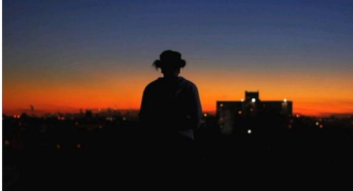
("Premature", framegrabs, timecode 1:07, 8:11)