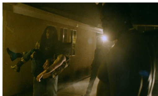
Frame grab 13.30